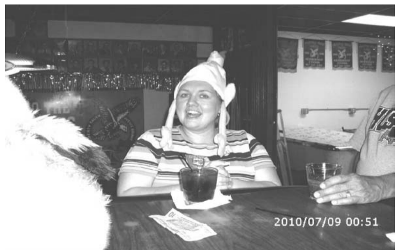
Relaxing and having a good time