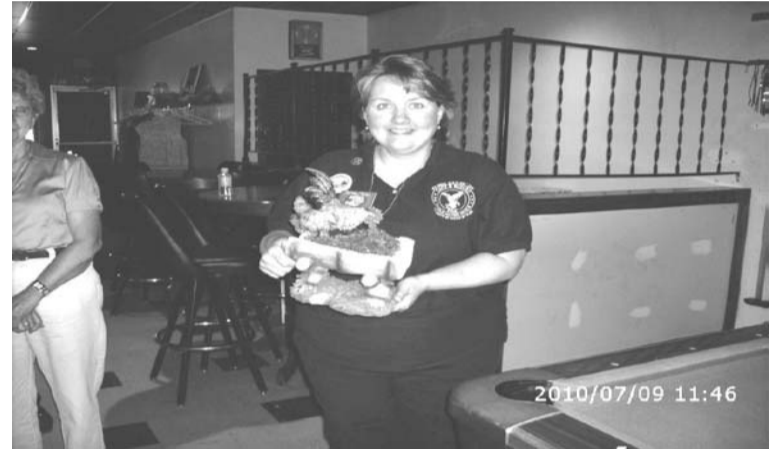
A gift from Wayne Auxiliary - A planter with chickens and guess what - Hen and Chicks are planted in it.